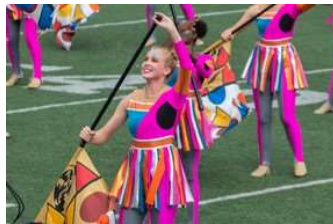
Color Guard/Winter Guard